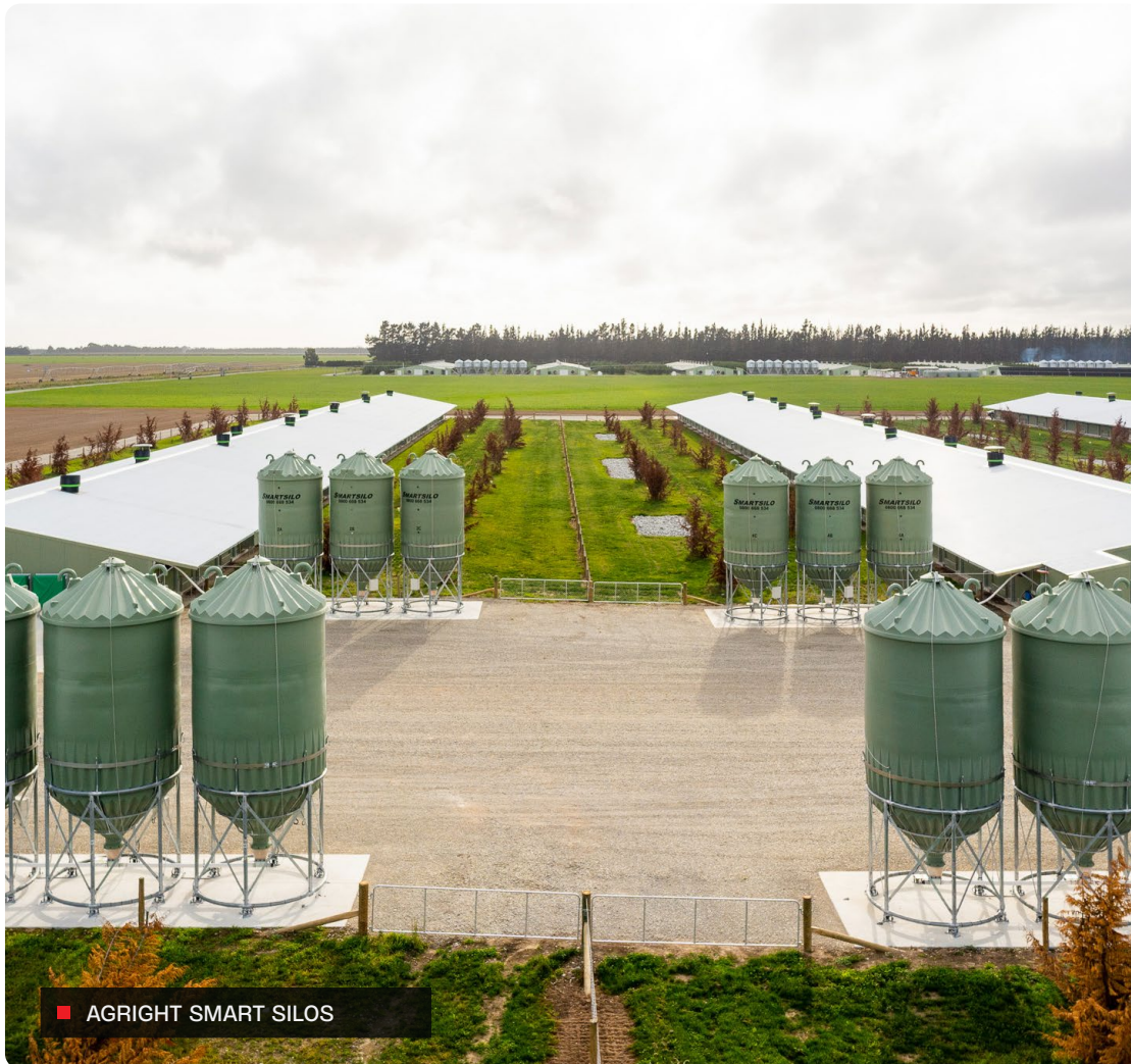
■ AGRIGHT SMART SILOS

CASE 01 · AGRICULTURAL STORAGE · SMART SILOS