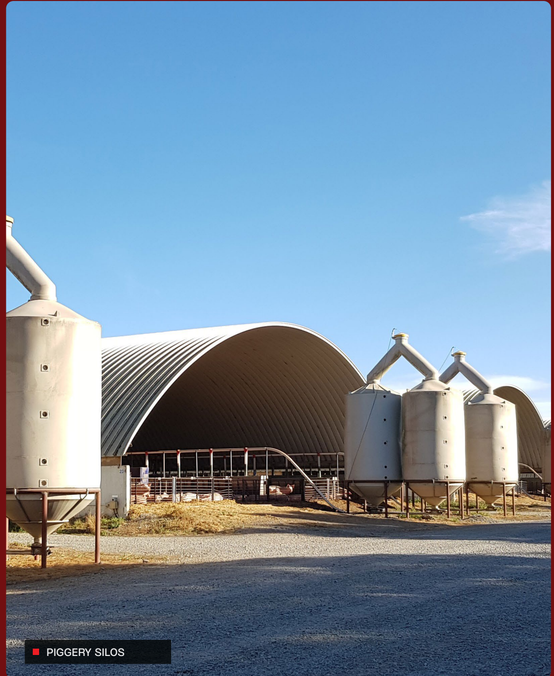
■ PIGGERY SILOS