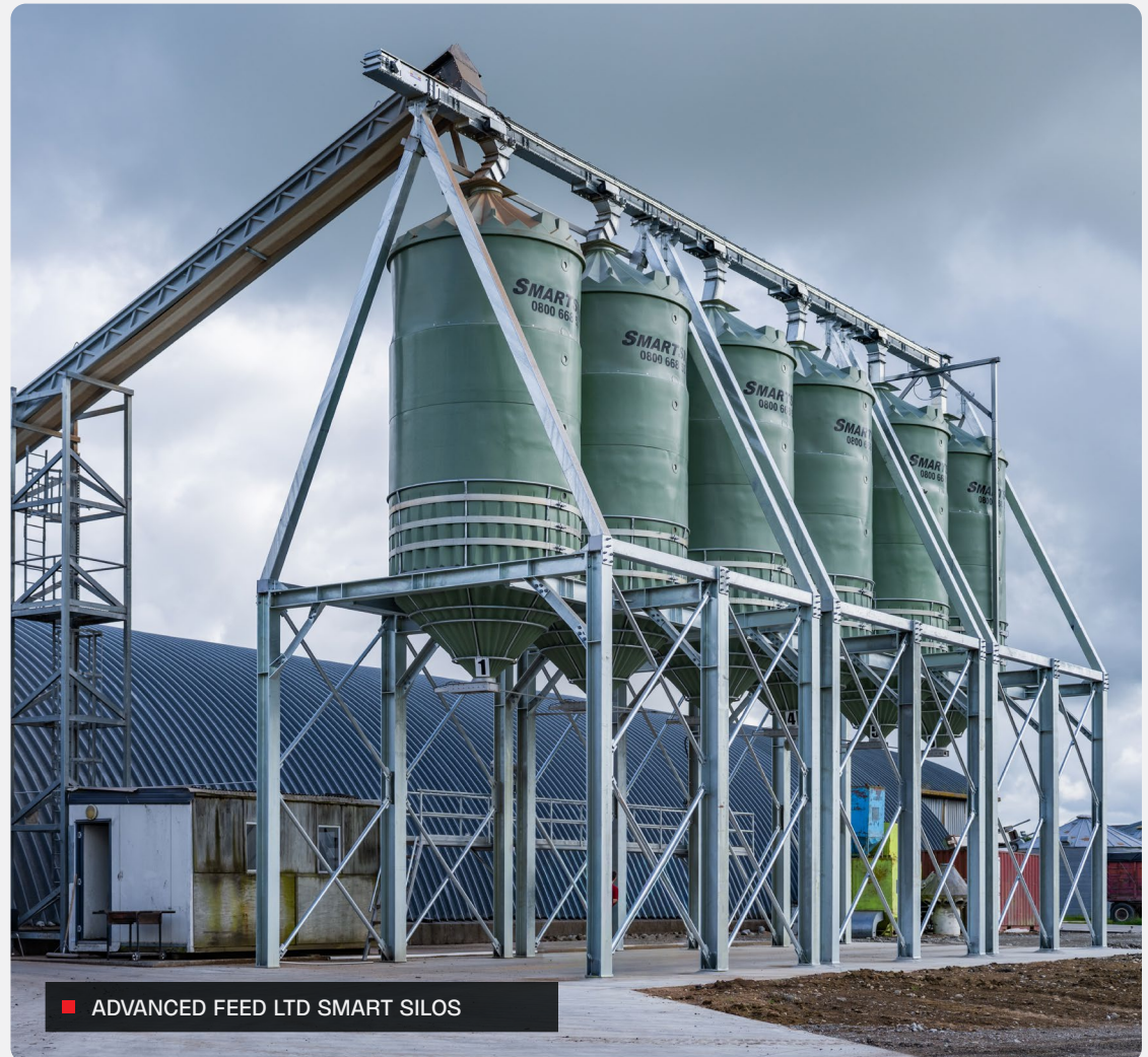
■ ADVANCED FEED LTD SMART SILOS